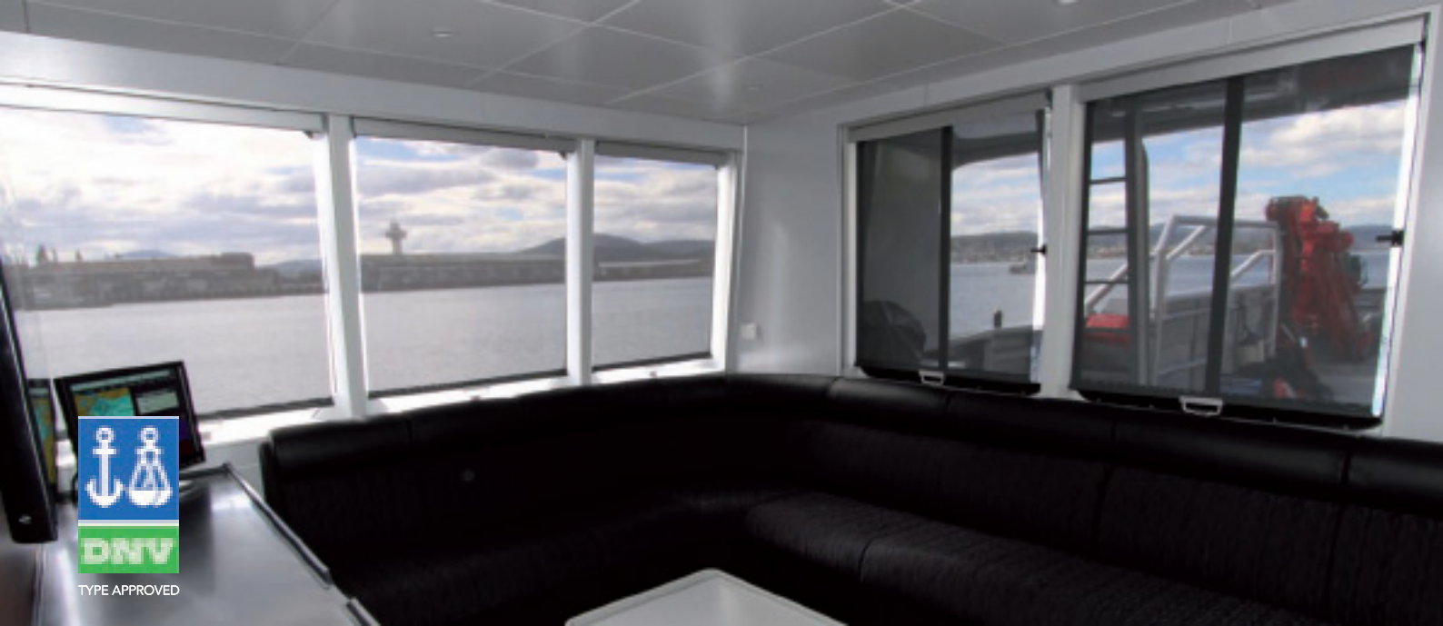
RDM Vessel Limitless fully fitted out with Norfolk Marine blinds