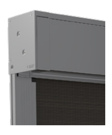
CUSTOMISED HEADBOX CONFIGURATION